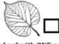
Leaf with ONE point