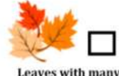
Leaves with many points